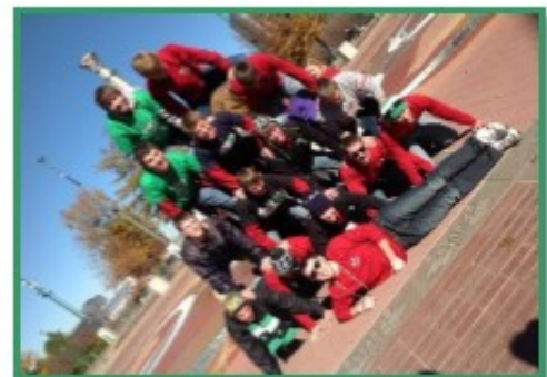
National Congress delegates at Centennial Park in Atlanta

Delegates may only attend once as a youth.