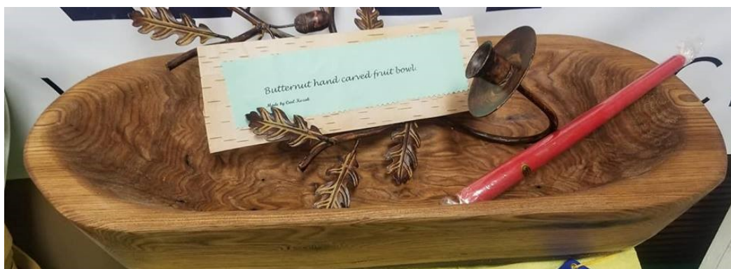
Items crafted by Woodworking project leader, Carl Kozak. Top Left: reclaimed cedar pole foot stool Top Right: barn wood wall art Bottom: Hand carved fruit bowl